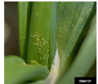
Figure 2. Thrips larvae feeding on an onion leaf.